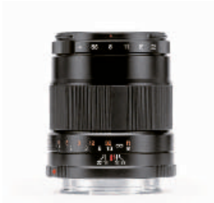
HASSELBLAD 4/90 MM 3024019

The dedicated 49 mm center filter is recommended for critical situations where transparency film is used. The center filter is normally not required when using negative film if the lens is stopped down to f/8 or smaller aperture.