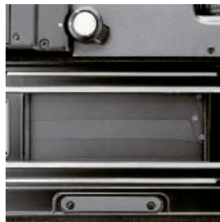
UNIQUE FOCAL PLANE SHUTTER TYPE

Inside the XPan II's sleek body lies an ingenious system that allows you to choose between formats without sacrificing quality along the way. You get Hasselblad tradition and reliability combined with 35 mm convenience. You get razor sharp images combined with a panorama negative almost three times larger than traditional masking techniques and over five times larger than those produced by APS cameras. No compromises, just possibilities.