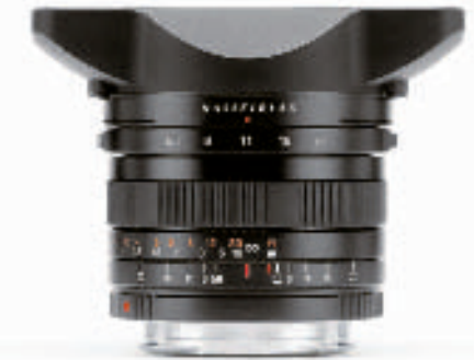
HASSELBLAD 5.6/30 MM ASPHERICAL 3024013

SUPPLIED WITH: VIEWFINDER XPan 30 3054472 VIEWFINDER POUCH XPan 30 3054463 LENS SHADE XPan 30 3054407 CENTER FILTER XPan 30 3054451 FRONT LENS CAP XPan 30 3054410 REAR LENS CAP XPan 3054412 LENS POUCH 1 3058408