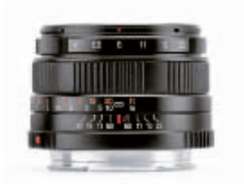
HASSELBLAD 4/45 MM 3024015

The very compact design and high image quality of the Hasselblad 4/45 mm make this lens the obvious choice as the standard XPan II camera lens. When used for panorama images the lens has a true wide-angle horizontal coverage of 71°.