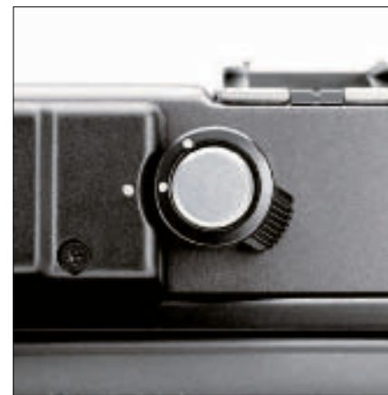
FORMAT CHOICE SWITCH FROM STANDARD 35 MM TO PANORAMA FORMAT AT THE FLIP OF A SWITCH.