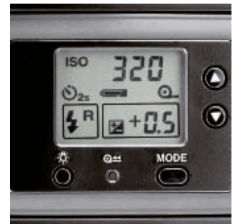
LCD EASY VIEWING OF CAMERA SETTINGS ON REAR DISPLAY